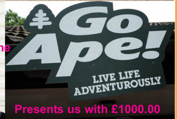
Presents us with £1000.00

DRIVING YOUR CHARITY HOME www.eastcoasttruckers.org