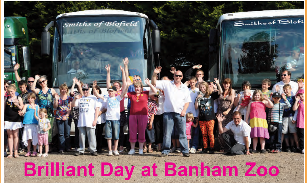
Brilliant Day at Banham Zoo

DELIVERING LOADS OF FUN TO SPECIAL CHILDREN