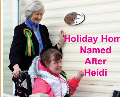
Holiday Home Named After Heidi